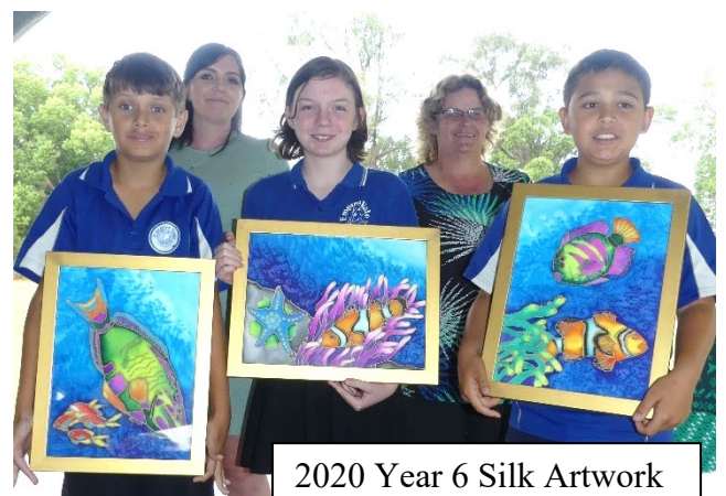
2020 Year 6 Silk Artwork